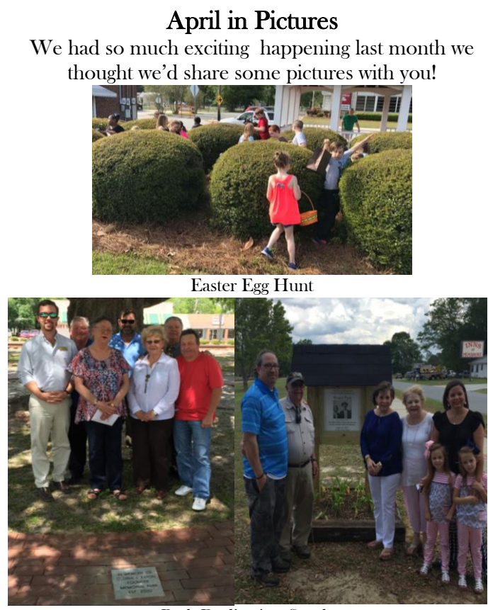
Park Dedication Sunday

Please help us Keep Pembroke Beautiful - if you see litter, pick it up. Enjoy the beauty of our community!